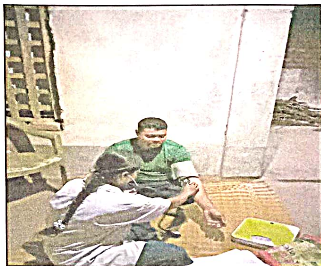
Plate 4: Different activities during survey of Service man of Bhagwanpur-II Block area